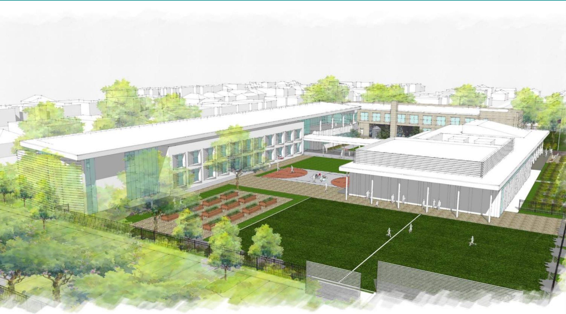
VIEW FROM MATILDA