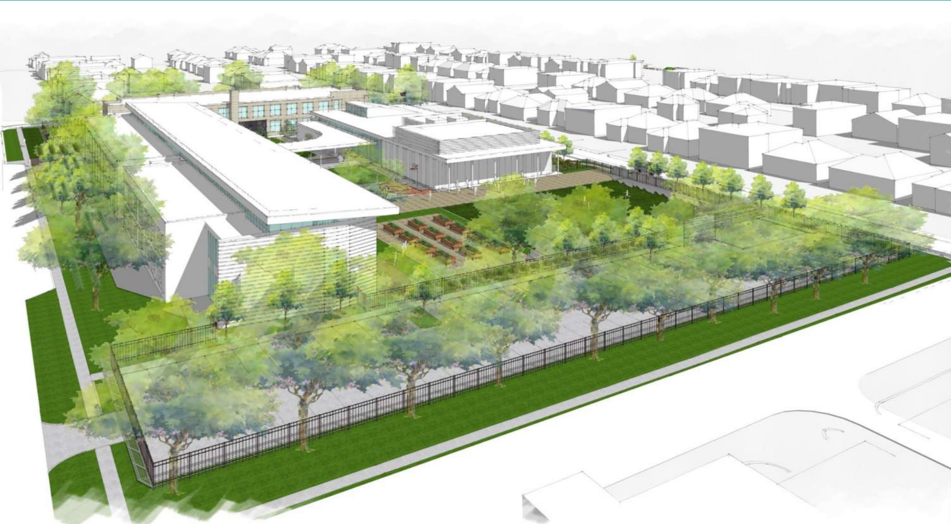
VIEW FROM MATILDA