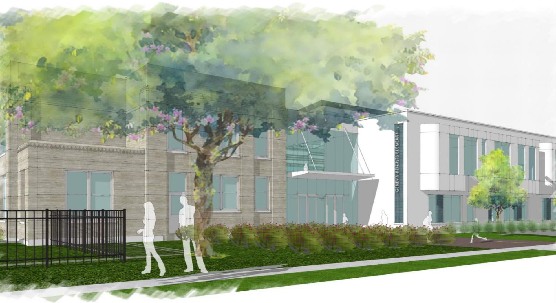
VIEW FROM VANDERBILT