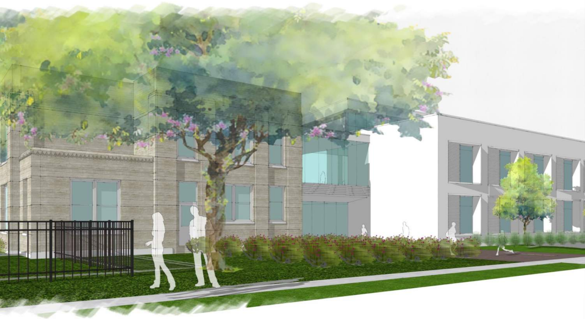
VIEW FROM VANDERBILT