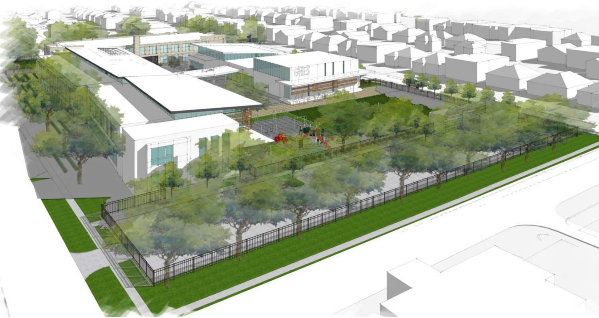
VIEW FROM MATILDA